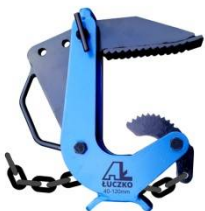
ZŁ 3C gripping range 40-120mm Permissible work load 1500 kg weight 27 kg