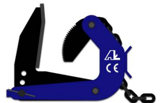
ZŁ 3C gripping range 90-220mm Permissible work load 3000 kg Weight 57kg