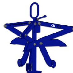
Gripping range 500-600mm Permissible work load 1000 kg weight 20kg