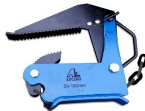
ZŁ 3C gripping range 50-160mm Permissible work load 3000 kg Weight 45kg